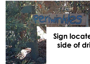
Sign located on left side of driveway.