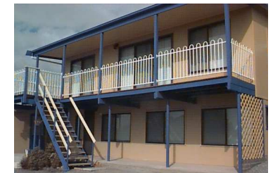
View of house from rear.