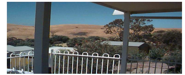
Summer view from Periwinkles balcony.

BYO sheets, pillow cases, towels and tea towels.